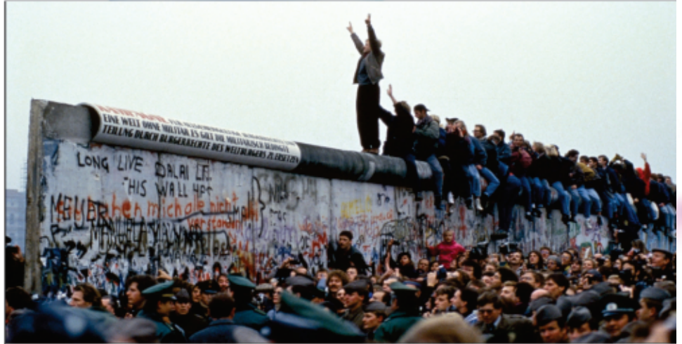
( Berlin Wall being fallen I - Nov. 1989).

In the preceding years before demolition of the Berlin Wall and during my business travels abroad