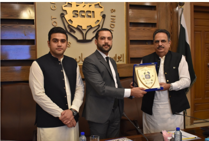
The meeting, held on August 11, 2023, featured Mr.