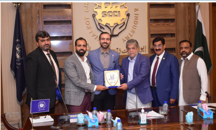
The seminar titled "Chief Value Officer – The Important

Evolution of the CFO" took place on September 11, 2023, in collaboration with ACCA. Key points include the transformation of the CFO role into the CVO, emphasizing strategic responsibilities such as data-driven decision-making, risk management, sustainability, and investor relations. ACCA was introduced as a globally recognized professional accounting body, emphasizing its comprehensive curriculum and the development of well-rounded professionals.