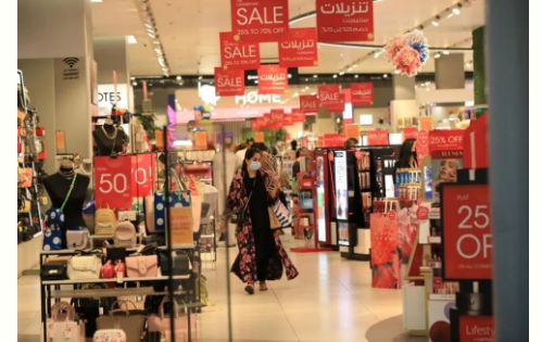
A shopping paradise