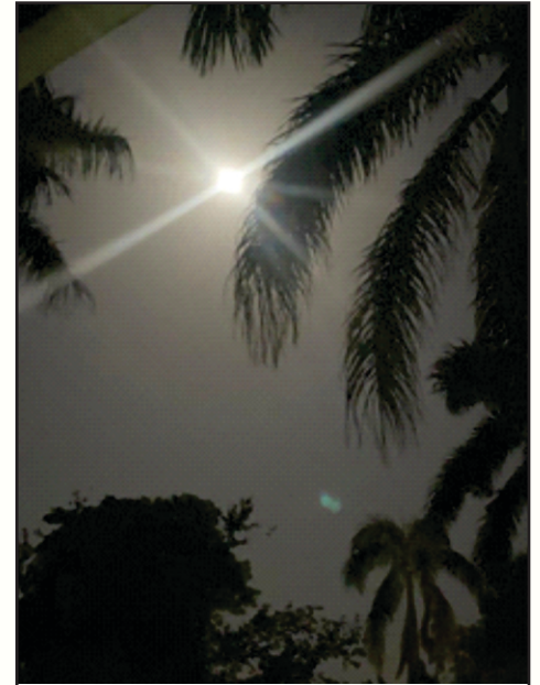
Super 'Blue Moon' captured by the scribe on 30 th August 2023 (the next will come in 2037)

world. The campaign videos showcase Dubai city's unique experiences and highlight its affordability and family-friendly environment, making it an ideal holiday destination beyond doubt, for the festive Pakistani visitors and especially so, when they are accompanied by their kids. 'The Kids Go Free' means a singular initiative that allows families to explore Dubai's diverse attractions with numerous classic landmarks.