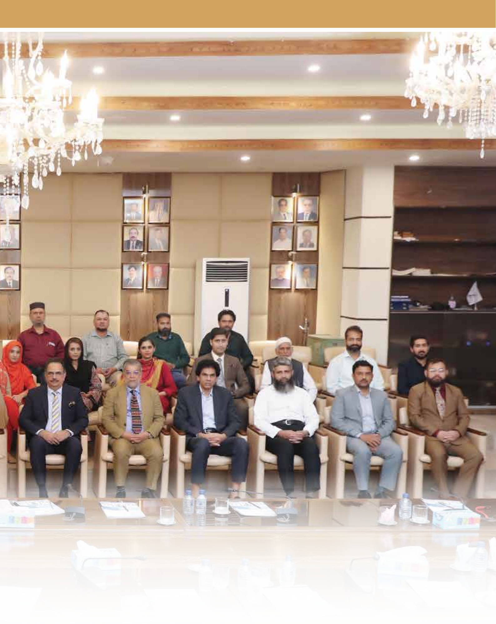
The Sialkot Chamber of Commerce & Industry