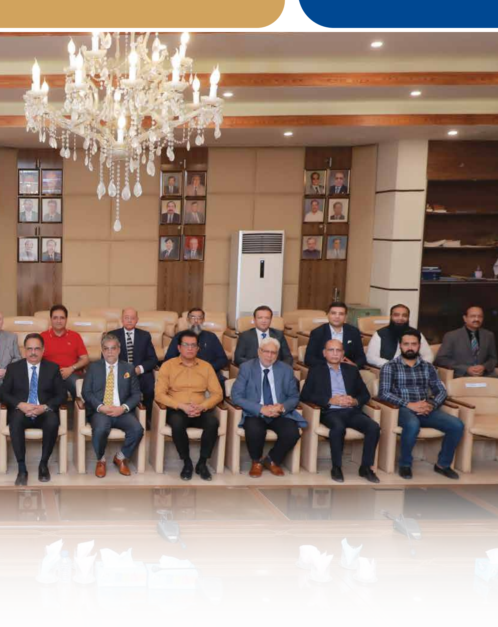
The Sialkot Chamber of Commerce & Industry