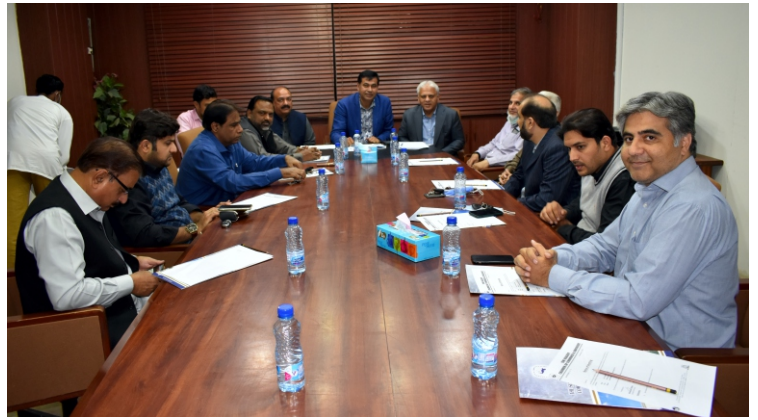
Meeting of Department Committee on Sports Activities