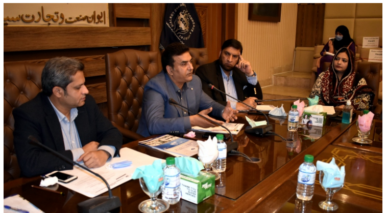
Meeting of Department Committee on Martial Arts/Fitness & Gloves Industry