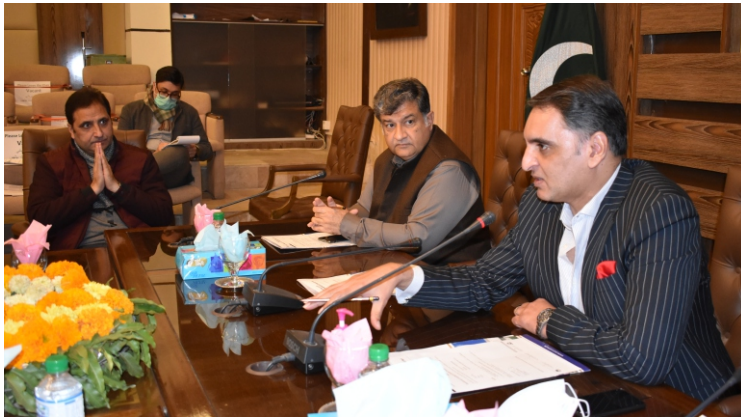
Meeting of Departmental Committee on Health, Personal Care & Allied Industries