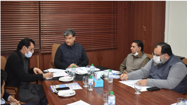
Meeting of Department Committee on Beauty/Single Use Instruments