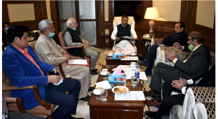
Meeting of Department Committee on Special Economic Zone, SIE/EPZ/SIC