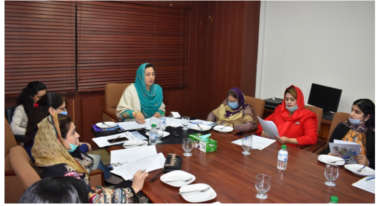
Meeting of Dep. Committee on Women Entrepreneurs