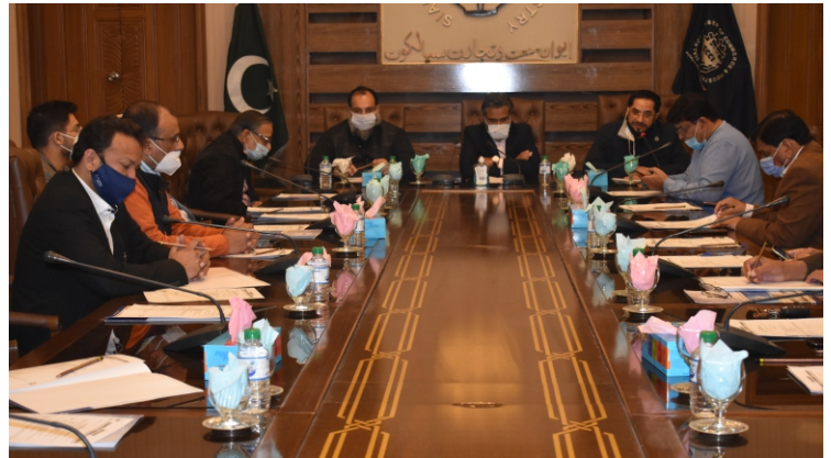
Meeting of Department Committee on Export Business Advisor