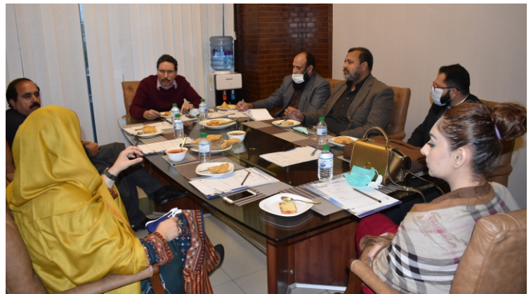
Meeting of Department Committee on Education