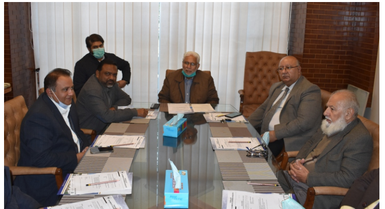
Meeting of Departmental Committee on Dry port / Airport