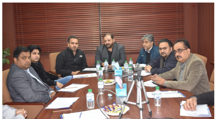
Meeting of Department Committee on IT/Cyber Crime