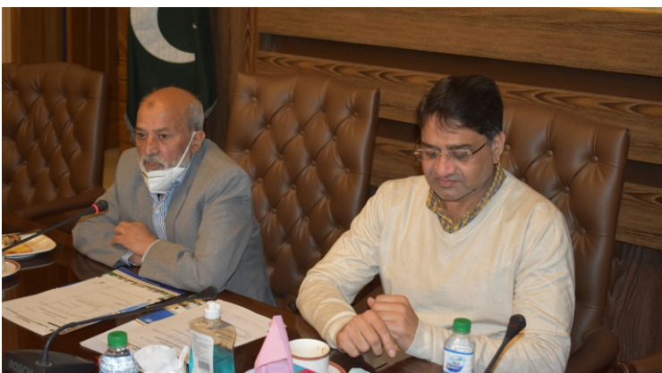
Meeting of Department Committee on WAPDA