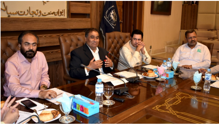
Meeting of Department Committee on Religious & Cultural Affairs