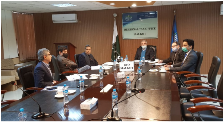
President SCCI meeting with Chief Commissioner FBR