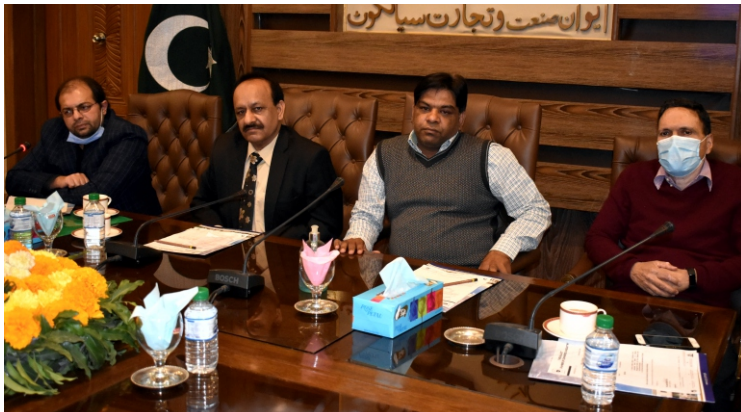
Meeting of Departmental Committee on Garrison HQ/ Cantonment Board Affairs