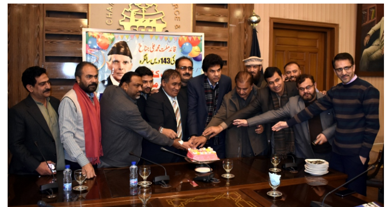
Quaid-e-Azam Birthday cake cutting ceremony at SCCI