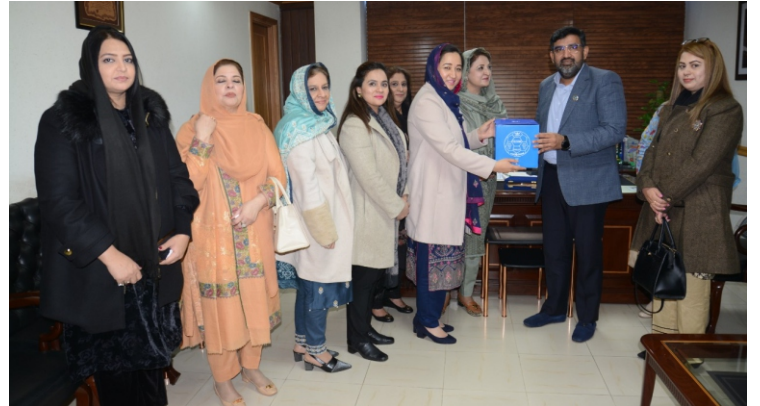
MOU Signing Ceremony Between SCC&I WRC and FCC&I WRC at Faisalabad Chamber