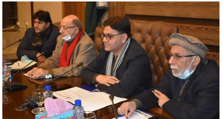
Meeting of Departmental Committee on Engineering