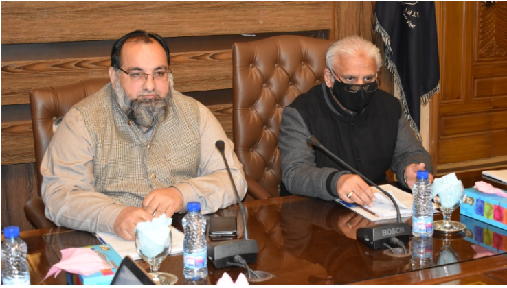
Executive Committee Meeting held on Dec 28, 2020