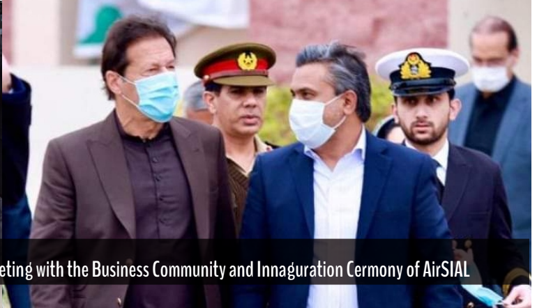
Visit of Prime Minister of Pakistan H.E. Mr. Imran Khan to Sialkot Meeting with the Business Community and Inauguration Ceremony of AirSIAL