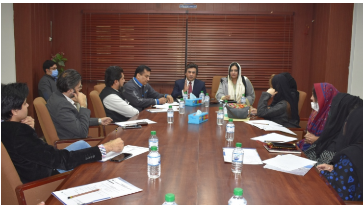
Meeting of Department Committee on Beauty/Single Use Instruments