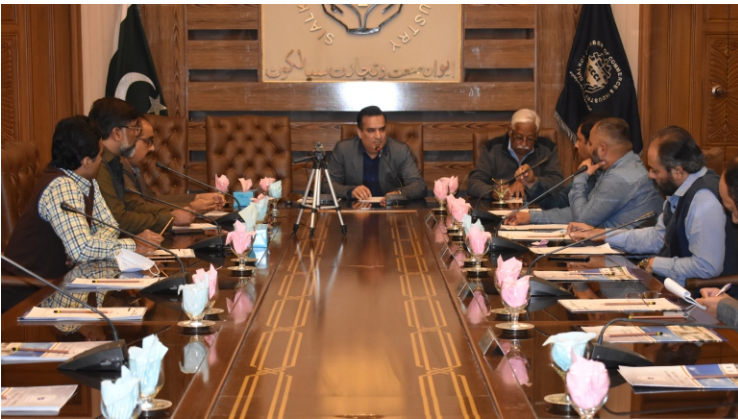
Meeting of Department Committee on Post Office/Telecommunication