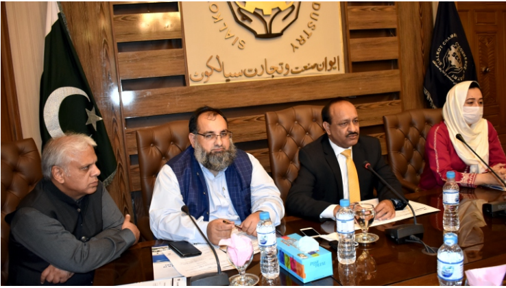
Meeting of Department Committee on Garrison HQ/Cantonment Board Affairs