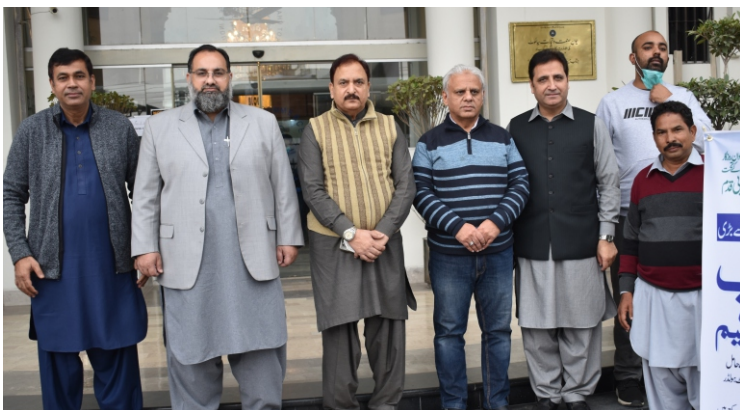
Meeting with Representative of Punjab Rozgar Scheme at SCCI