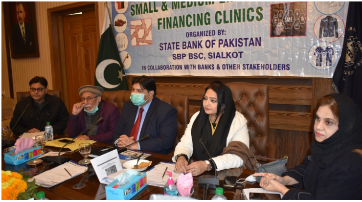
Seminar of State Bank of Pakistan on Woman at SCCI