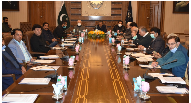
Meeting of Business Advisory Council at SCCI