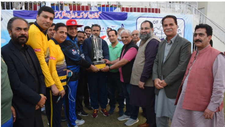
Friendly Cricket Match between Golden Economic Triangle Chambers of Commerce and Industry, Sialkot Chamber, Gujrat Chamber and Gujranwala Chamber