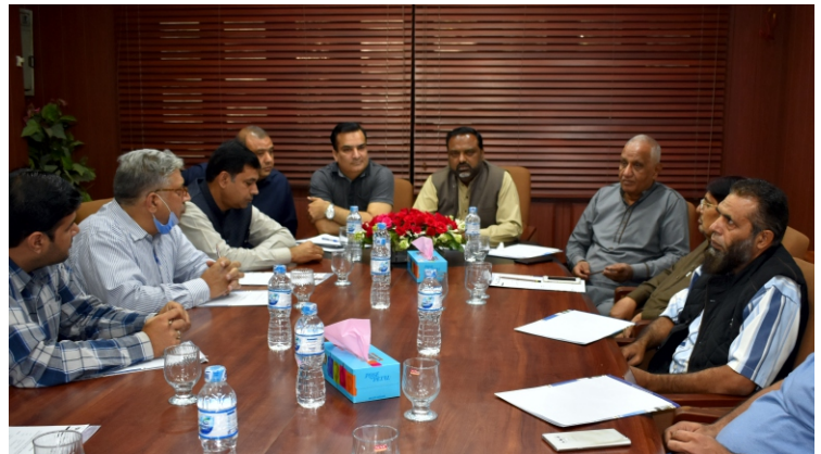
Meeting of Department Committee on TMA