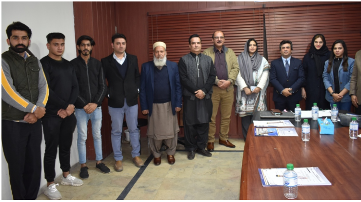
Meeting of Departmental Committee on SME