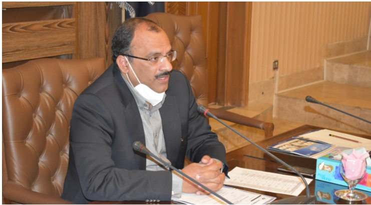
Meeting of Departmental Committee Military Apparel/ Military Uniform & Badges Industry