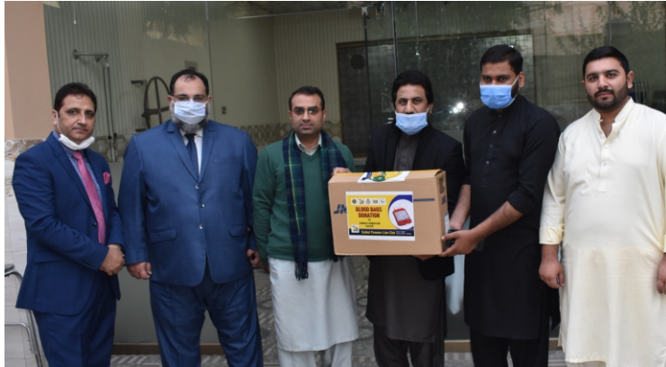
Visit at Sundas Foundation Office, Sialkot