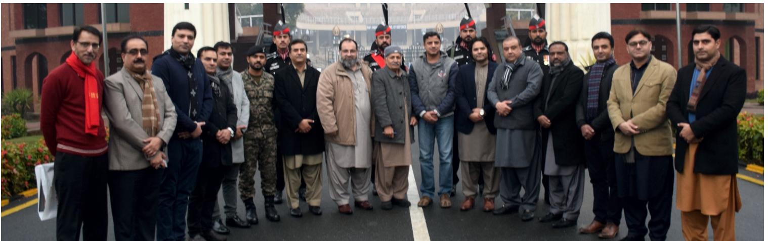
Visit of Wagah Border, Lahore