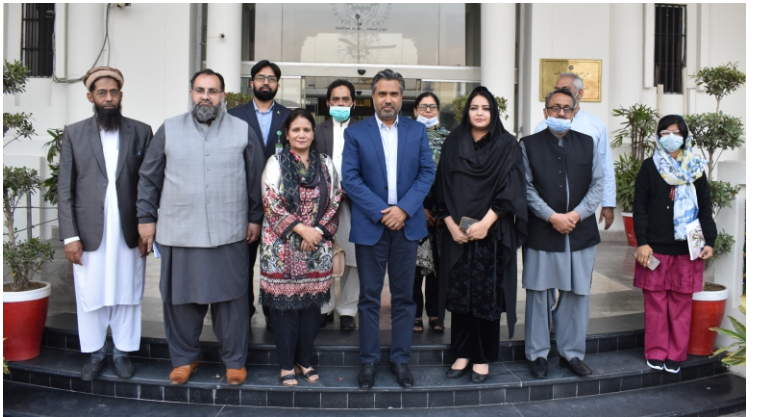
MOU Signing Ceremony of GC Women University of Sialkot with Sialkot Chamber of Commerce & M/s. Dr. Frigz SURgical