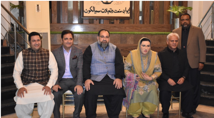
Visit of Dr. Firdous Ashiq Awan, Special Assistant to CM Punjab for Information at SCCI