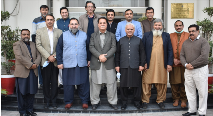
Meeting with a Delegation From Cutlery Association