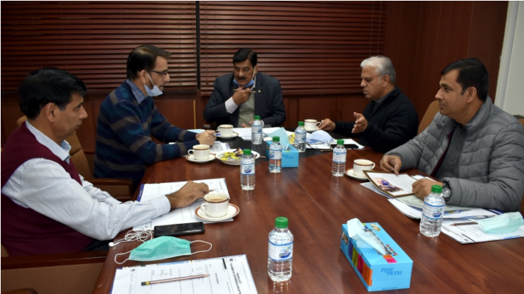
Meeting of Department Committee on Accounts & Finance