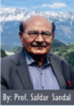
By: Prof. Safdar Sandal

Apart from the exploitation in trade, taxes, labour and property, the British did something so disastrous that its effects, can be felt even today. From numbers-point of view, the English officers and troops that could be sent to colonies were few compared to the indigenous population. In order to cover up this complication, the British formed