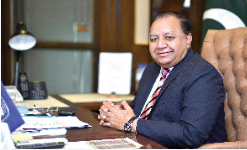
معزز اراکین جمیہ!